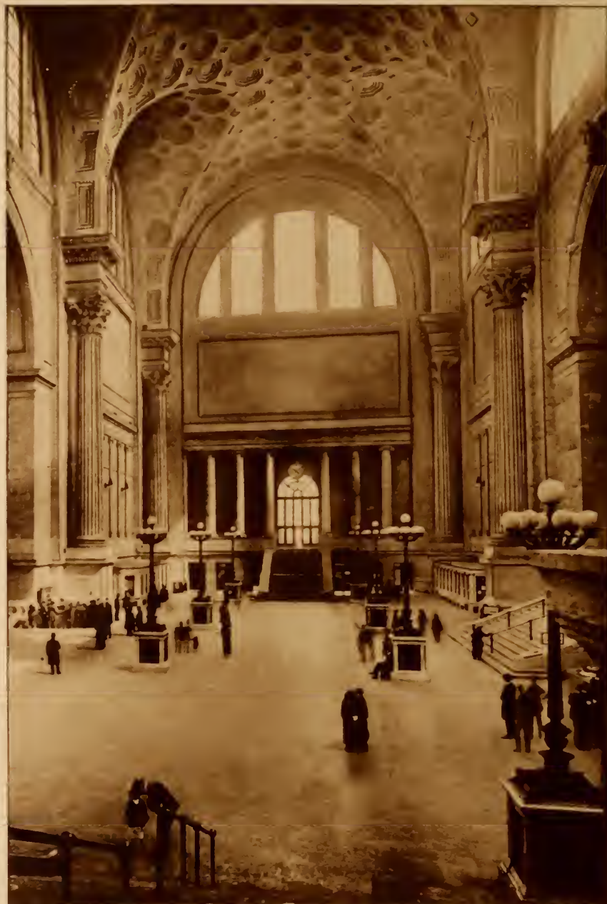
INTERIOR OF PENNSYLVANIA STATION. Its architecture suggests a cathedral. It is the largest Railroad Station in the world.